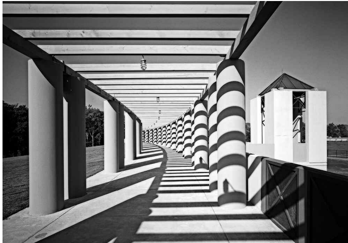
Riverbend Music Center, Cincinnati OH. Designed by Michael Graves.