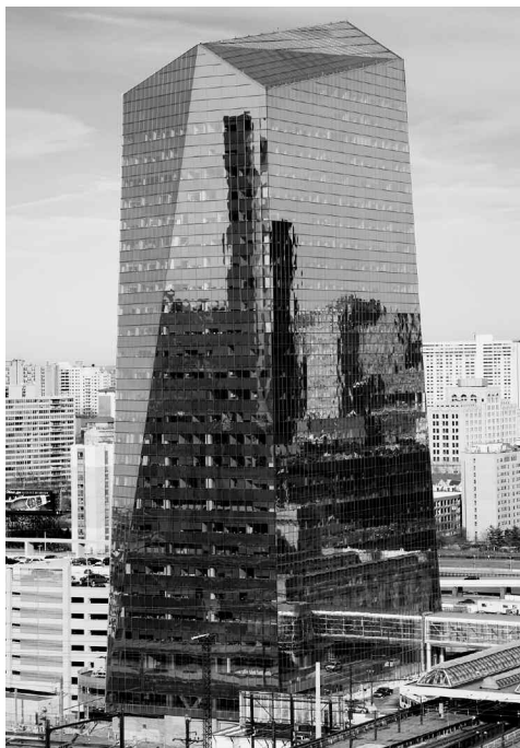
Cira Center, Philadelphia PA. Architects: Cesar Pelli Associates Architects and BLT Architects.

Besides these benefits to the architect and publisher, the publication can benefit the entire architectural profession and especially its students and emerging practitioners. Architectural designs are not created in a vacuum but within an evolving tradition