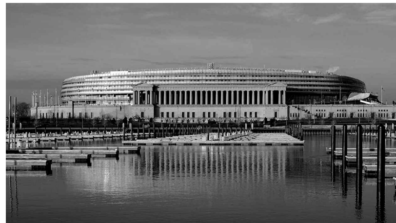
Soldier Field Renovation. Architects: Lohan, Caprile & Goettsch and Wood + Zapata.

Try to match your needs with a photographer’s strengths, professionalism and compatibility with your style. The right photographer for you is one who understands your design ideas and can communicate them visually to the wider world.