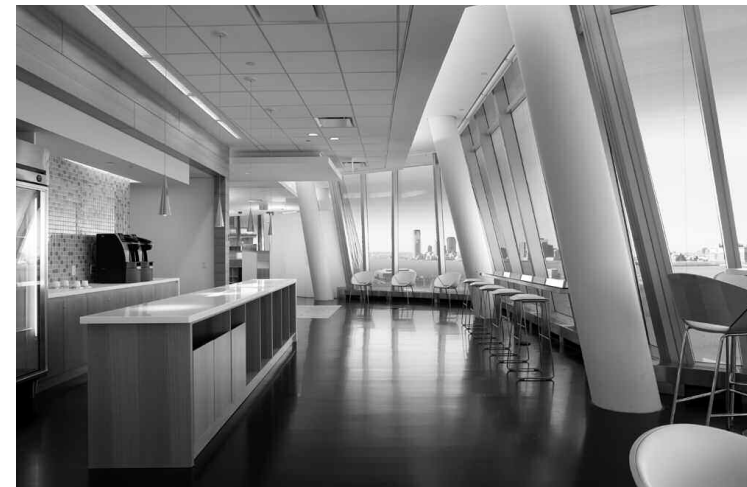
IAC/InterActiveCorp headquarters, New York. Building designed by Frank O. Gehry; interior architecture by Studios Architecture.